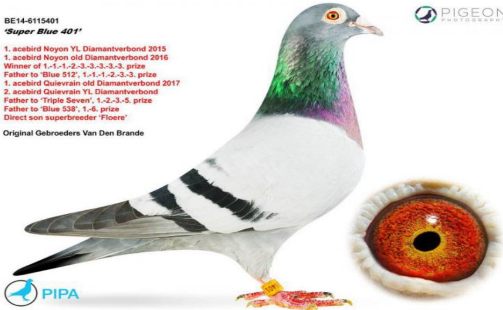
Super Blauwe 401, a top class racing and breeding bird for the Van Den Brande brothers