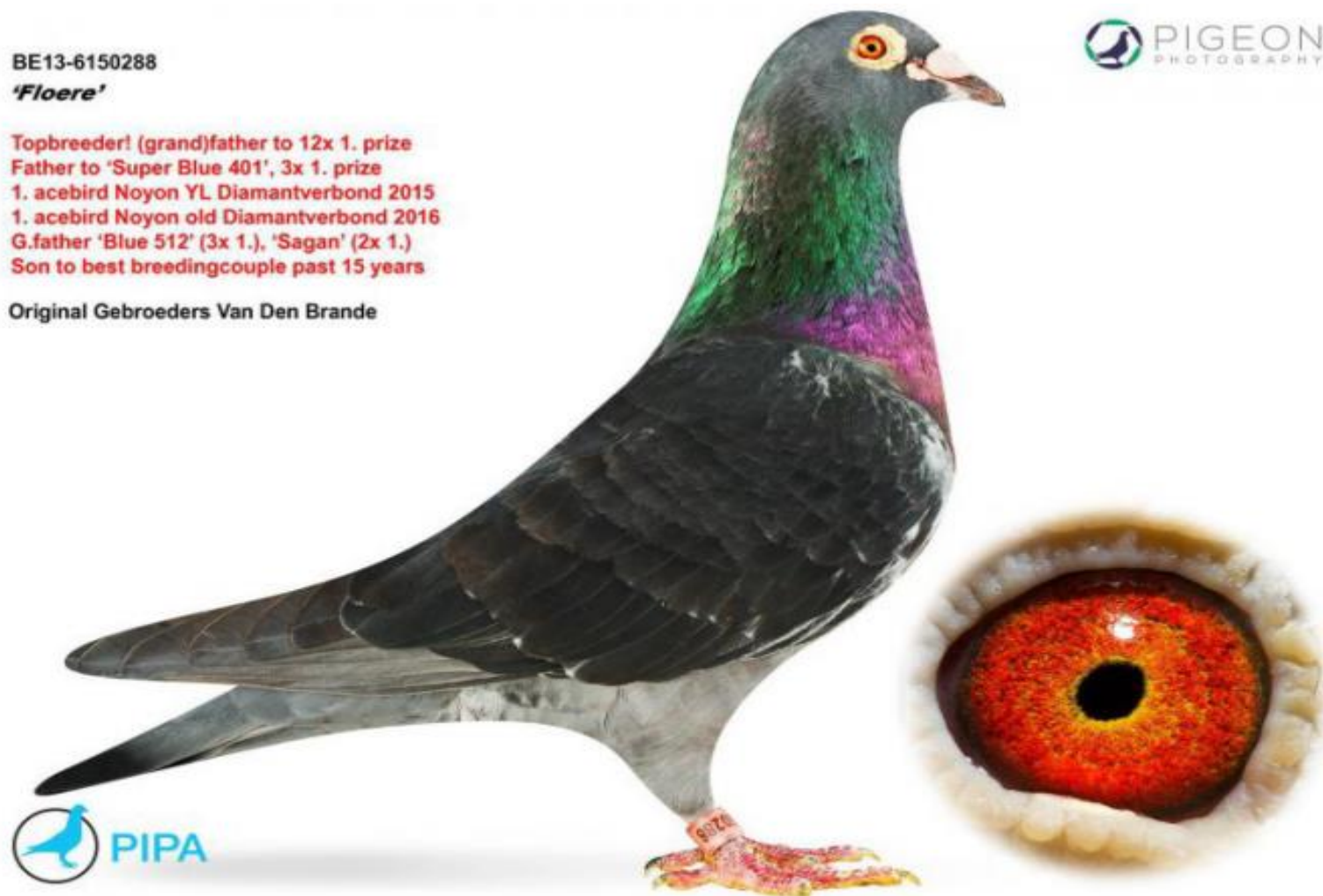
Floere, the grandfather of three invaluable generations!

The dam of Blauwe 512 is one of a kind as well. Sneeuw witje is the dam of 4 first prize winners, and she the grandmother of two top class racing birds for the Jager Brothers (Blijham, NL). NL17-1568829 wins a 2/4,215, 2/2,710 and a 14/6,695 pigeons. Nestbrother NL17-1568828 wins in turn a 1/3,421, 2/3,780, 4/13,013, 8/2,624 pigeons, etc.